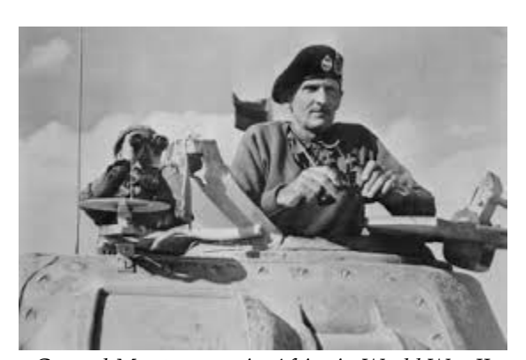
General Montgomery in Africa in World War II

In the one series influence is conveyed down the chain such that the troops carry out the command initiated by the first orderer. The ordinative act of each member of the series reflects that of his immediate superior, back to the first. Each link is essential ( per se ) to the execution of the order, to the be (the very existence) of the order.